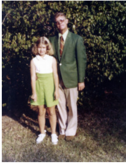
Me and my dad