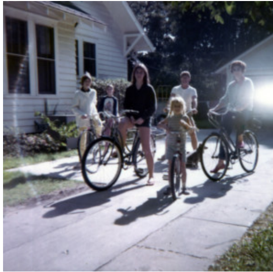
The whole family heads out for a bike ride

And it wasn't just the rules. It was the lack of connections. My best friends all seemed to have large, noisy, extended families always visiting, but not us. I don't know why, exactly, though I remember one fight my parents had with rare visitors who expected freshly laundered towels every day. My aunt and uncle left in a huff, and I never saw them again. I met one older cousin a couple of times with his "good friend" (as my grandmother called him), but he died when I was still a teenager. And one of my sisters has OCD, which was not identified nor treatable in those days. She washed her hands hundreds of times a day, and the unofficial diagnosis was "crazy."