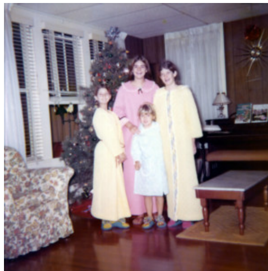
Me and my sisters (I'm the smallest one.)

And it wasn't just the rules. It was the lack of connections. My best friends all seemed to have large, noisy, extended families always visiting, but not us. I don't know why, exactly, though I remember one fight my parents had with rare visitors who expected freshly laundered towels every day. My aunt and uncle left in a huff, and I never saw them again. I met one older cousin a couple of times with his "good friend" (as my grandmother called him), but he died when I was still a teenager. And one of my sisters has OCD, which was not identified nor treatable in those days. She washed her hands hundreds of times a day, and the unofficial diagnosis was "crazy."